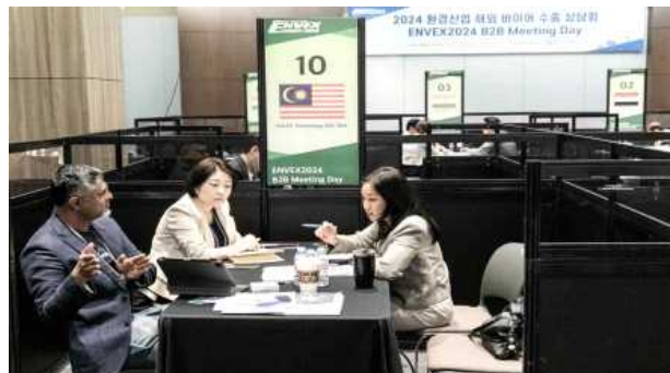
< Domestic and Abroad Business Meetings >