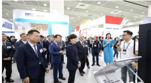
< Opening Ceremony >