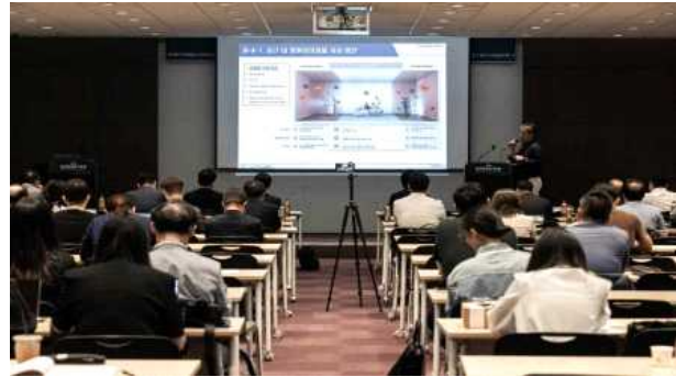
< Seminar >